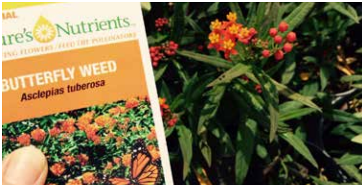
Mislabeled! This plant is NON-NATIVE . It typically has flowers that are red-orange with yellow centers but can be solid yellow. It has an upright growth pattern with long and thin leaves.

Many nurseries say that they carry one of our native butterfly milkweed ( Asclepias tuberosa ), but from my experience, 99.9% of the time they are really selling the non-native tropical milkweed, A. curassavica (also called Mexican milkweed among other names). Last week at Home Depot on Northlake Blvd., a non-native milkweed was incorrectly labeled A. tuberosa . As seen in the photo with wrong label, the non-native milkweed is typically red-orange with yellow centers and sometimes solid yellow. Both native and non-native milkweed are easy to grow and attract Monarch butterflies to drink the nectar and lay eggs upon; however, scientists tell us that to ensure the health of the Monarchs we should plant only native milkweed.