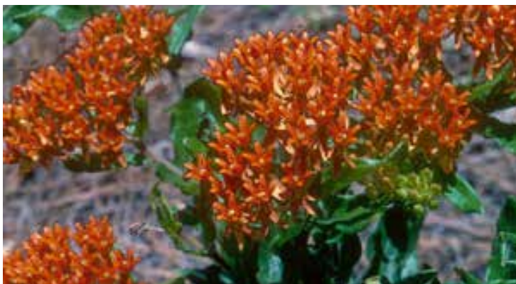
This is the REAL Asclepias tuberosa , native to Florida pinelands. Most often the flower is orange but can be red or yellow. It has a small bushy growth pattern with rounded leaves.

At the February meeting of the Palm Beach County Chapter of Florida Native Plant Society, I had the pleasure of hearing entomologist Sandy Koi present the amazing scientific details about the chemistry between plants and insects and how they have evolved together for hundreds of thousands of years, developing very “specialized” relationships in order to survive. Monarchs and milkweed are highly specialized; milkweed is a toxic plant, but the monarch butterfly and larva are able to chemically “bind” the toxins in parts of their bodies and use it as a defense mechanism against predators. It is the high levels of toxins in our native milkweed that are so important to the monarch as they journey back and forth from north to south. The non-native tropical milkweed lacks the high amounts of toxins needed.