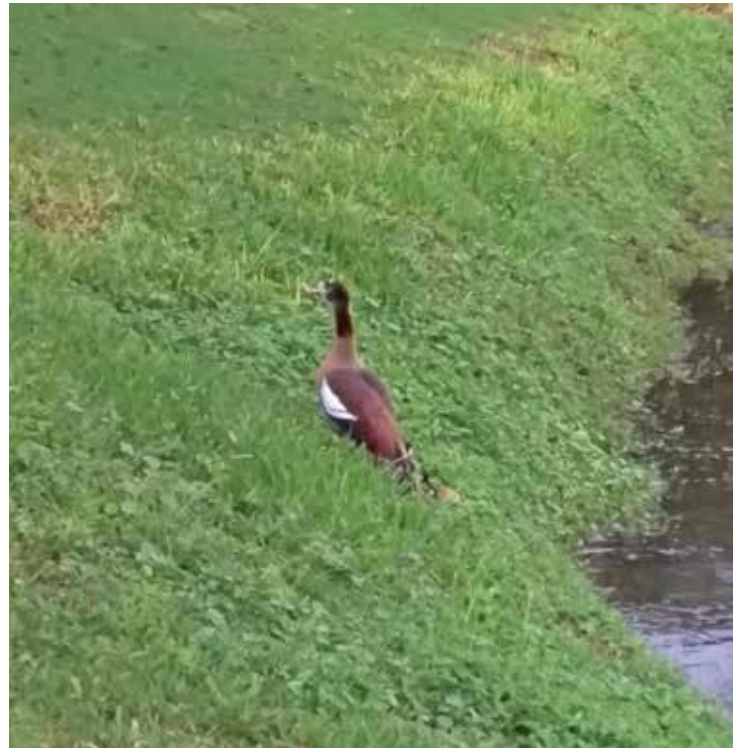
Mamma goose watching her chicks being rescued